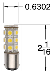
BA15d Double Contact D.C. Index Bayonet Base