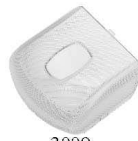
3009 Replacement Lens